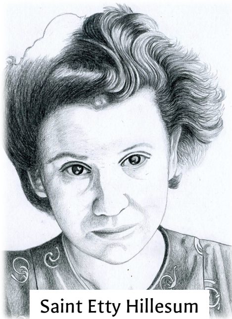
Saint Etty Hillesum

KINDLY KEEP ALL MICS MUTED DURING SERMON